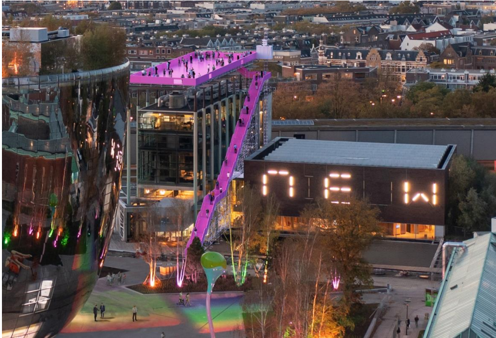
The Podium on the roof of Het Nieuwe Instituut, Festival heart Rotterdam Architecture Month, designed by MVRDV.

The organization of the Rotterdam Architecture Month (RA Month) cordially invites designers, design schools and other parties who feel involved in the development of the spatial domain to submit projects for the RA Month 2022 main exhibition. The exhibition can be seen throughout the month of June at Het Nieuwe Instituut, Festival heart of the RA Month. Projects can be submitted until Sunday 27 March at the latest.